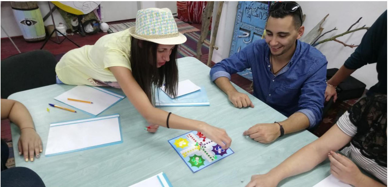
Some pictures taken at the 4 th of October 2017 are following: